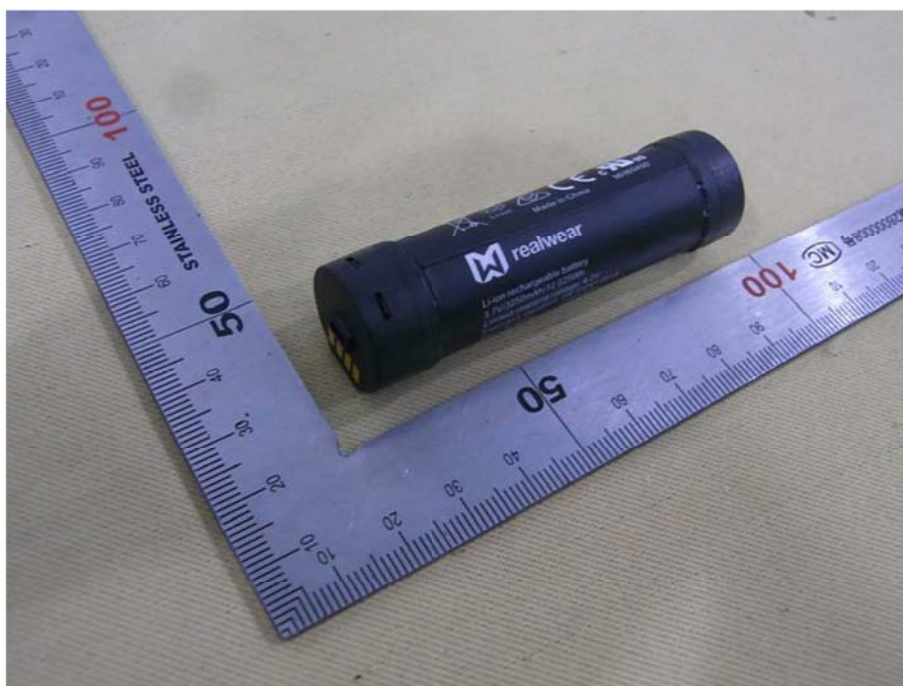
电池组 (背面) Battery (back view)