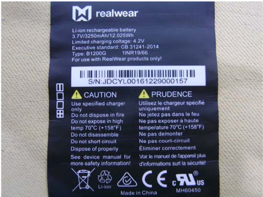
电池组铭牌 Battery Nameplate