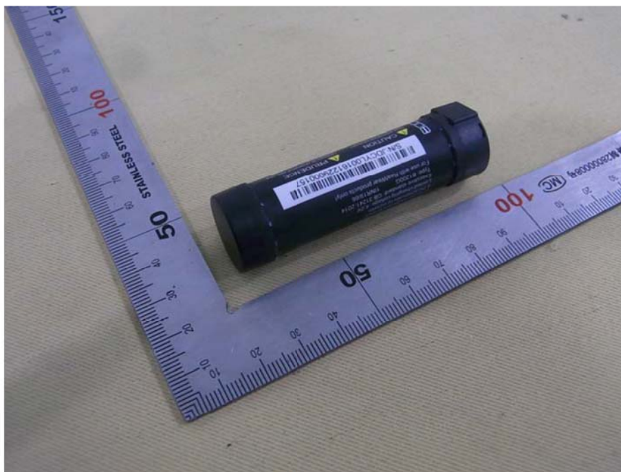
电池组 (正面) Battery (top view)