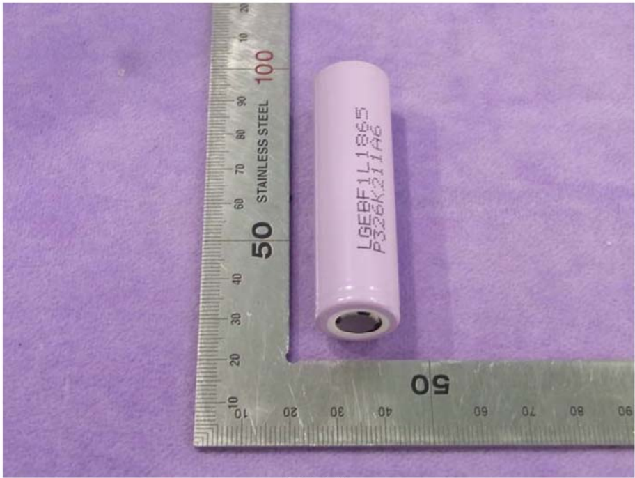
元件电池 Component cell